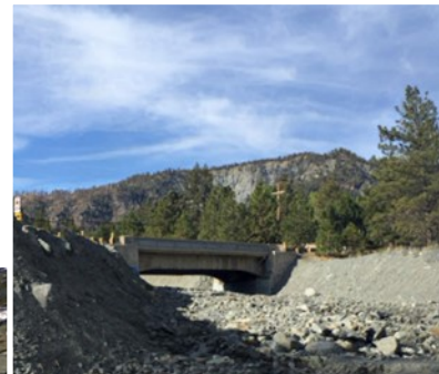
Sheep Creek Bridge looking east/ Above photo looking south