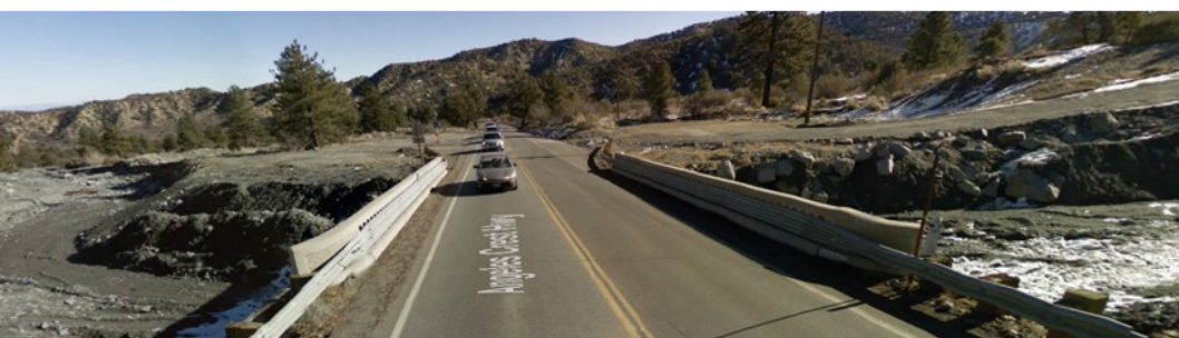
Sheep Creek Bridge looking east/ Above profile looking west