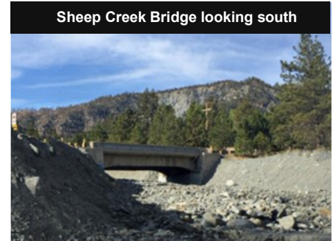
Sheep Creek Bridge looking south